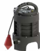
Sanipump GR S